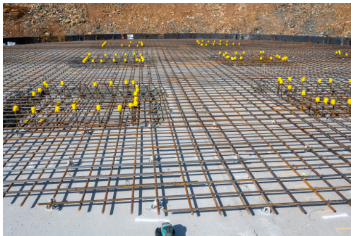
Valleyfield balance tank foundation

Construction on both the Poatina and Valleyfield balance tanks is well underway with bulk earthworks including rock blasting now completed. The foundation works are now progressing. The tanks will hold 3.45 ML and 1.35 ML respectively.