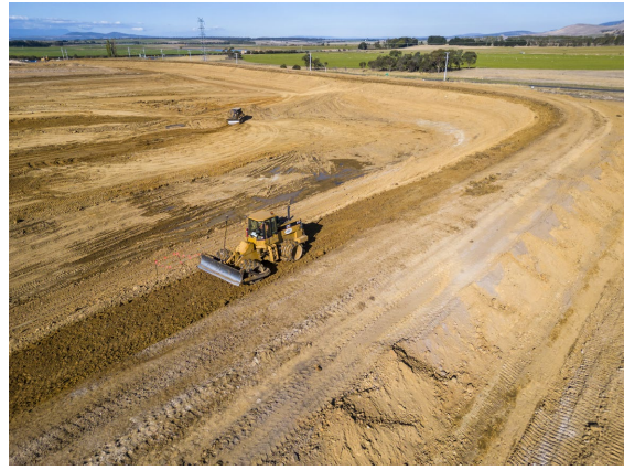
Embankment construction – Poatina Buffer Dam

The dam outlet pipes have been installed and pressure tested. The earthen embankment is also now well underway with 60 per cent complete. Once this is completed the focus will be on the structural components, instrumentation and the Hydro Tasmania interface.