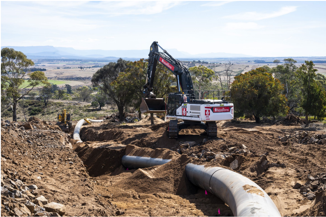
Challenging pipeline installation conditions, Valleyfield Road

Pipe manufacturing is also progressing well, meaning a continuous supply is available to the project work crews and there is no delay in installation.