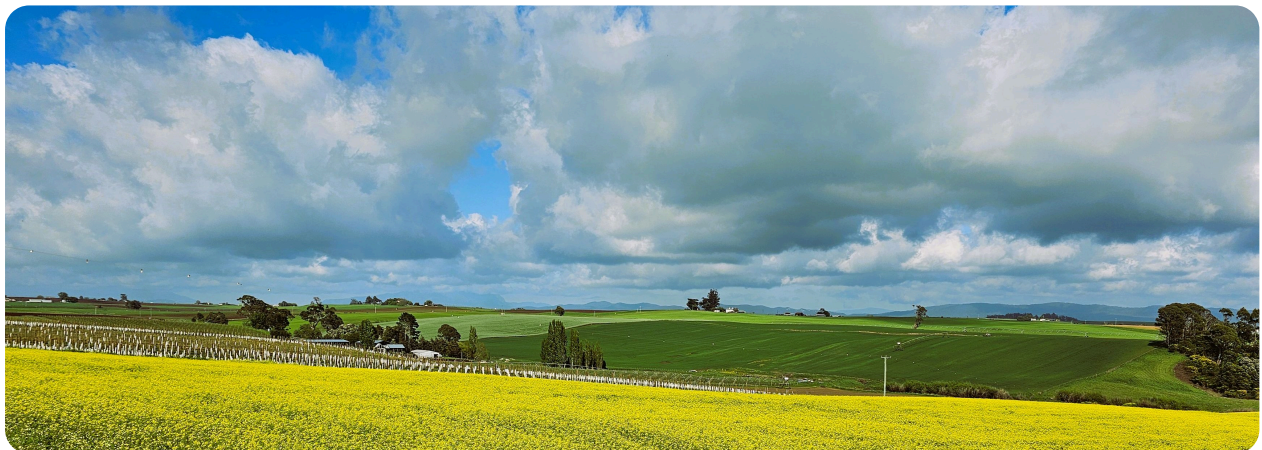
Vineyards and canola crops at Eastford Creek, Sassafras