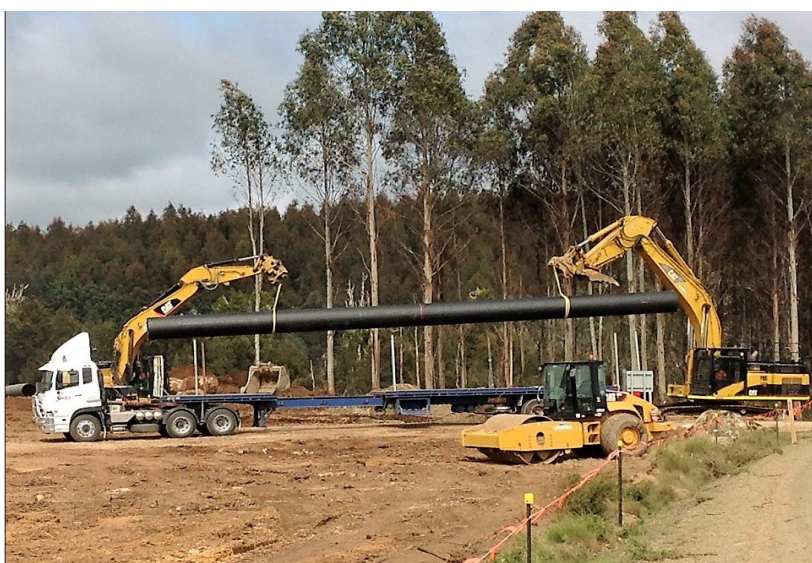
Pipe Delivery to Camden Rivulet Dam

Commencement of pipe laying has been slightly delayed from the original program; and as a result, first water deliveries are expected to flow in February 2020 . This means that only a part-season supply will be available in the first irrigation season. TI will write directly to irrigators in the new year to confirm the process and possible timing for the first season supply.