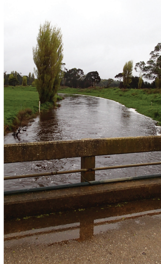
Winter flows in the Montagu River