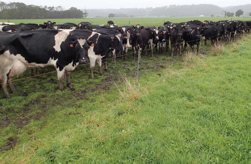
Waiting for milking

With a water sales period now planned to be November - December 2014, a business case won't be provided to the State Government until April 2015. Ideally, if funding was available the construction contracts could be tendered in the second half of 2015 for a January - February 2016 start to works. This is also dependent on the final scope of works and could mean that water will be available for the 2017-18 irrigation season.