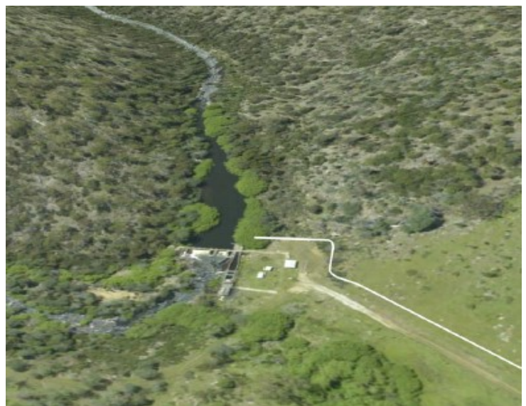
TasWater Weir, the North Esk pump station will be immediately upstream

Farm WAP's are required to be completed and in place prior to being able to receive water from a Tasmanian Irrigation Scheme. TI will assist with the preparation of the FarmWAP to get ground work in place for consultants. TI's FarmWAP team will be in touch well ahead of water being available, to assist irrigators in the preparation of these documents. Timing for this is likely to be starting over the next few months