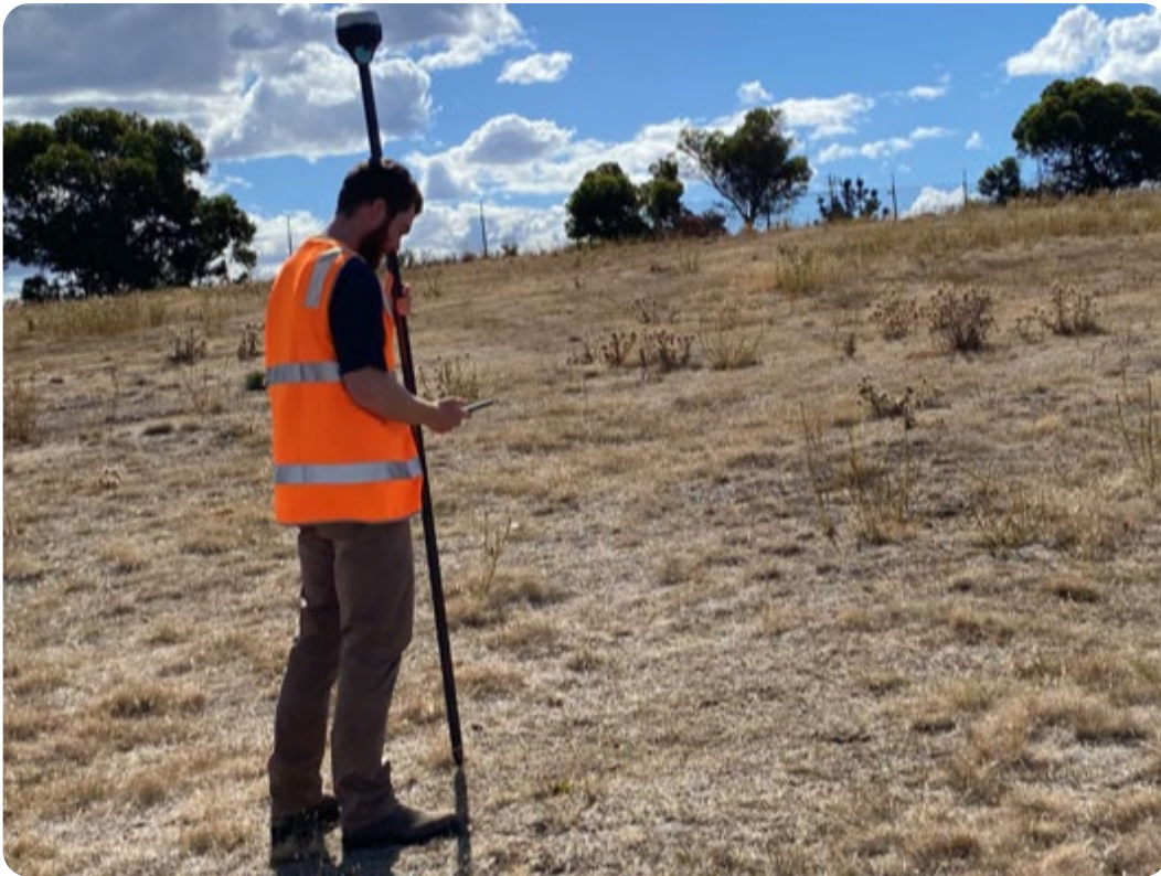
Engineering surveys along the alignment.